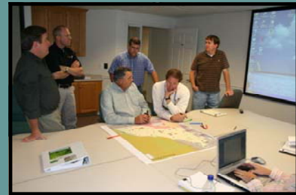
Pleasant Grove City Land Use Meeting